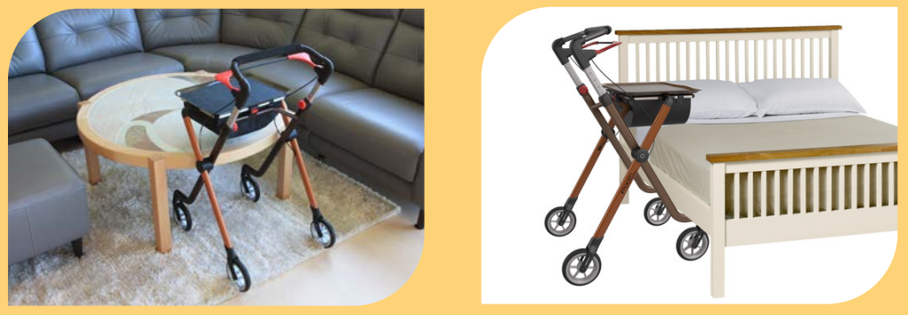
The frame design allows PIXEL to move closer to your chair, couch or bed, being used as side table.

Integrated rear wheel caster prevents rollator from getting stocked when passing by door openings, furnitures etc. In addition it prevents interior from being scratched.