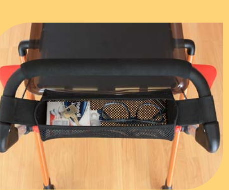
With PIXEL, you get also a practical open net bag for storing personal items such as mobile phone, TV remote control, medicines, glasses, keys etc.