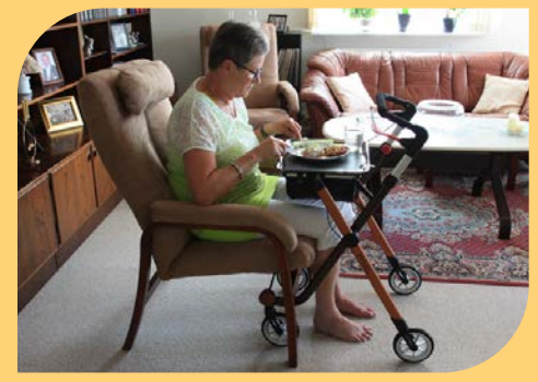
PIXEL and its tray can be used as a serving trolley or as a table to eat from.