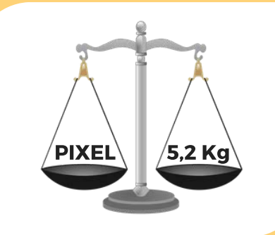
With its 5.2 kg (incl. tray table and textile basket) PIXEL is one of the lightest indoor rollators on the market.