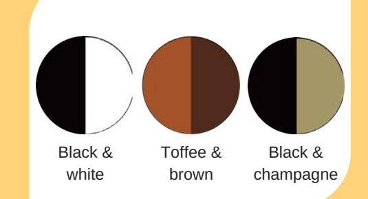
PIXEL is available in 3 color combinations: classy black & white, natural toffee & brown and sophisticated black & champagne.