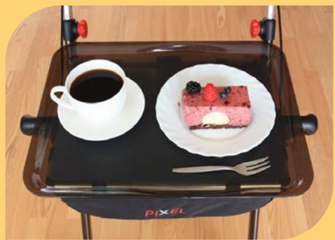
Includes a detachable tray in a nice smoke brown color, practical size and shape as standard. Dishwasher proof.