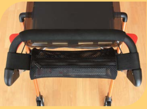
Practical net bag with zipper for storing personal items such as mobile phone, medicines, glasses, keys etc. Item number: ACR01032