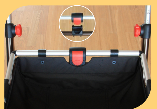
PIXEL is equipped with a unique locking system that makes it easy to lock or unlock the rollator when you want to fold or unfold it.