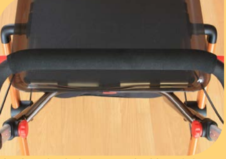
The hand grip is covered with soft foam and is very comfortable to hold.