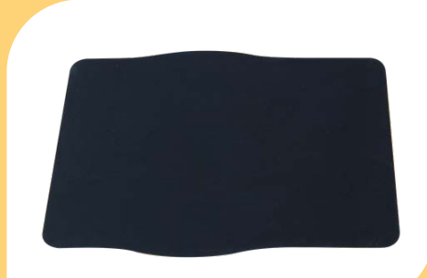
Anti slip mat for tray, black. Item number: ACR01037