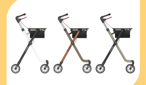
Stylish, unique and modern design. The frame of PIXEL is made of aluminum.