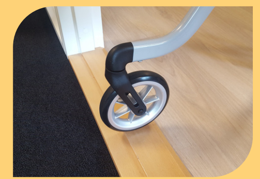
The rollator design combined with very low weight and super soft wheels provides extremely good performance when climbing door steps etc.