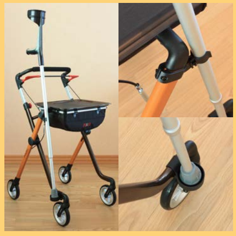
Crutch holder - Item number: ACR01012P

*PIXEL is fully assembled in cardboard box and ready for use. *Application: For indoor use.