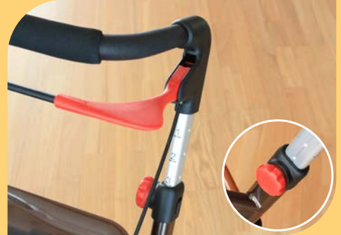
The push handle is easy to adjust to the required height (86-97 cm) with 5 adjust. increments that are marked with numbers 1-5. It can be also done with one hand.