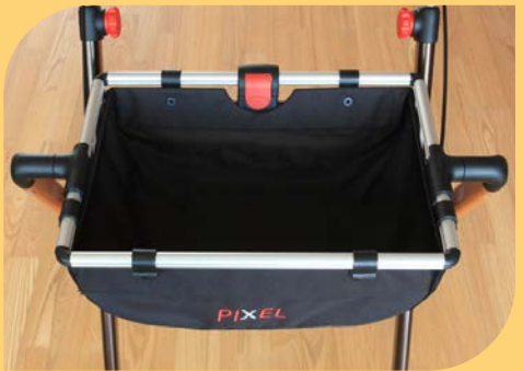
Includes a removable and washable textile basket for storage or moving of slightly bigger things as standard.