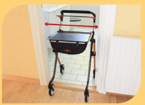
With its width of 54 cm and swiveling front wheels, it can easily turn and pass very narrow doors, for example kitchen or toilet doors in old apartments.