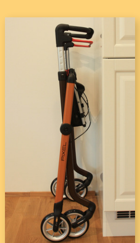
Convenient, space saving storage - PIXEL is very easy to fold, unfold and store. Folding and unfolding can be done in 3 steps. It stands on its wheels when folded. Remains locked in folded position.

To unfold it, just do the opposite in reverse order.