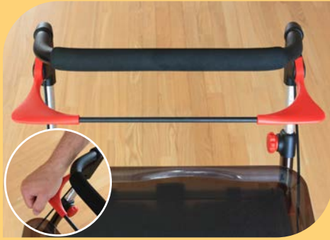
The hand brake control bar with user friendly paddles can be easily adjusted and works smoothly in two ways. It can be easily operated with one hand.